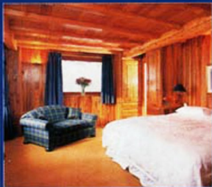
Le Chardon, Val d'Isère

SUMPTUOUS CHALET IMPECCABLE SERVICE GOURMET FOOD & FINE WINES FLIGHTS & PRIVATE TRANSFERS